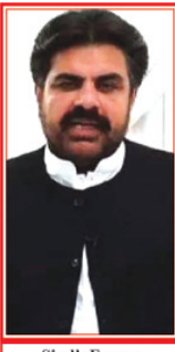
Sindh Energy Minister Nasir Shah Criticizes Judiciary's Pro-PTI Ruling