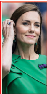
Kate Middleton finally returns to her royal duties amid cancer battle