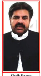
Sindh Energy Minister Nasir Shah Criticizes Judiciary's Pro-PTI Ruling