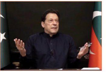
Imran Khan speaking at a press conference.

pears to be a major breakthrough, an Islamabad district and sessions acquitted Imran and his spouse Bushra Bibi against their conviction in the Iddat case, clearing the last legal hurdle keeping the PTI founder in jail.