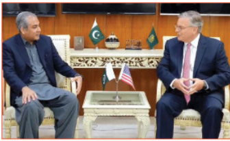
Interior Minister Mohsin Naqvi and US Ambassador Donald Blome in a meeting.

The move came after the federal government, last month, announced its decision to launch a new anti-terror drive titled "Operation Azm-e-Istehkam" — which drew reservations from several political parties including the Pakistan Tehreek-e-Insaf (PTI), Jamiat Ulema-e-Islam (JUI-F), the Awami National Party (ANP), Jamaat-e-Islami (JI). The Centre has maintained that "no large-scale military operation is being