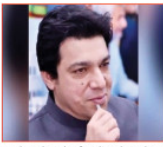
Senator Faisal Vawda speaking.

ISLAMABAD: Senator Faisal Vawda has said that the Supreme Court's decision on the reserved seats case will have an adverse effect on the Pakistan Tehreek-e-Insaf (PTI). Vawda said the opposition would continue to splinter in the coming days, making it increasingly difficult to manage. He said the PTI could soon face internal conflicts and the emergence of "forward blocs" since the nomination of reserved seats candidates has to be made by the chairman who is not in the position to do so and hence the party could further fragment. The larger bench of the Supreme Court led by Chief Justice Qazi Faez Isa announced its short order on Friday. The decision was reached with an 8-5 split, with five judges issuing dissenting notes. However, the majority decision of eight judges, including Syed Mansoor Ali Shah, Munir Akhtar, Muhammad Ali Mazhar, Ayesha A. Malik, Athar Minallah, Syed Hasan Azhar Rizvi, Shahid