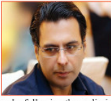
Chaudhry Moonis Elahi.