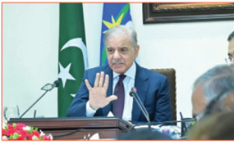
Prime Minister Shehbaz Sharif speaking.

During a visit to FBR Headquarters, PM Shehbaz said that the incumbent government had the sole agenda of putting Pakistan on path of progress with consistent improvement in the economic indicators.