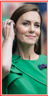
Kate Middleton finally returns to her royal duties amid cancer battle