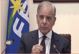
Prime Minister Shehbaz Sharif speaking at a press conference.

"This cabinet has done a great deal of work to make sure we achieved this goal," he said. "But, we need to pursue a long and difficult journey to augment our macro-