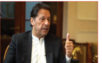
Imran Khan speaking.

Recalling that he held negotiations with former chief of army staff Gen (ret'd) Qamar Javed Bajwa, the PTI founder said that they had formed