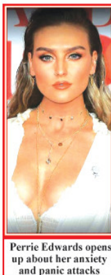
Perrie Edwards opens up about her anxiety and panic attacks