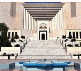
Ayesha Malik, Athar Minalah, Syed Hasan Azhar Rizvi, Shahid Waheed, Irfan Saadat Khan, and Naqem Akhtar Afghan.

-PTI gets major relief in historic judgment!