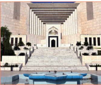
Ayesha Malik, Athar Minallah, Syed Hasan Azhar Rizvi, Shahid Waheed, Irfan Saadat Khan, and Naeem Akhtar Afghan.

The verdict on the Sunni Ittehad Council (SIC) reserved seats case was announced by a full bench of the Supreme Court led by Chief Justice Qazi Faez Isa. It comprised of Justices Syed Mansoor Ali Shah, Munib Akhtar, Yahya Afridi, Aminuddin Khan, Jamal Khan Mandokhail, Muhammad Ali Mazhar,