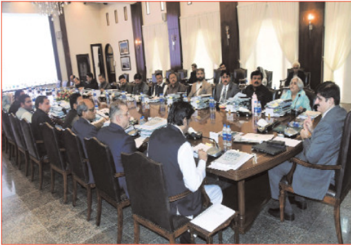
KARACHI: Sindh Chief Minister, Syed Murad Ali Shah is presiding over a cabinet meeting at the CM House.