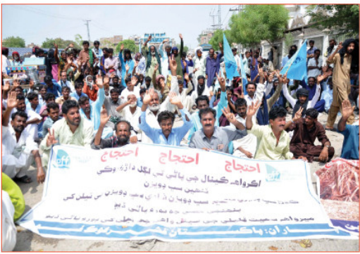
HYDERABAD: Members and leaders of the Pakistan Fisherfolk Forum are protesting for the acceptance of their demands, outside Sindh Irrigation and Drainage Authority's building.