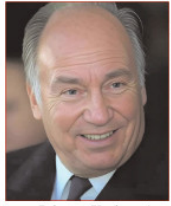
Prince Karim Aga Khan, who succeeded his

TALHAR: The 67th Imam Day of Prince Karim Aga Khan, the spiritual leader of the Ismaili community was celebrated across various regions of the country, including Ismaili Jamatkhanas and Ismaili Centers. Due to the solemnity of Muharram, the occasion of Imamat was observed with simplicity. Special prayers were offered for the prosperity, peace, and well-being of the coun-