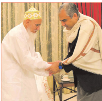
KARACHI: Federal Interior Minister Mohsin Naqvi is meeting with the head of the Dawoodi Bohra community, Syedna Mufaddal Saifuddin.-RT

The federal health officer stationed at the airport subsequently issued a death certificate for the woman. After completing