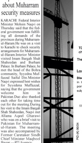
PFD (K) 8024

the current labor laws grant the right to permanent employment to workers, but the "Sindh Labor Code" seeks to legalize the illegal contract labor system, thereby imposing a wage slavery system in workplaces and providing capitalists with a legal excuse to evade their responsibility.