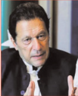
shares a rather contentious history with CJP Isa as it was his government that had filed a presidential reference against the incumbent chief justice in 2019 for allegedly owning properties abroad under his wife and children's names and not mentioning them in his health statement.

ISLAMABAD: Pakistan Tehreek-e-Insaf (PTI) founder Imran Khan has said that the issue of amendments in the National Accountability Bureau (NAB) ordinance is not about himself but in fact relates to the whole of the country.