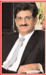
Murad Orders Completion Of Malir Expressway's Phase One and Start Of Hub Canal Project By August 14

PCB confirms sacking Wahab Riaz, Abdul Razaq