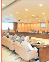
The caretaker government had announced the repatriation of all illegal foreigners citing security concerns in October last year. The decision was alleged to be meant for Afghan refugees, a charge that was denied by officials.

ISLAMABAD: Pakistan on Wednesday decided to grant a one-year extension in the stay of registered Afghan refugees, allaying their fear of being sent back to Afghanistan.