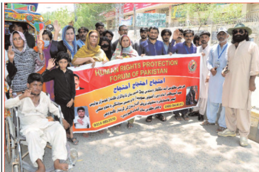
HYDERABAD: Residents of Husri are holding a protest demonstration which was organized by the Human Rights Protection Forum at the Hyderabad Press Club against their area's influential persons.

administration has taken proactive steps by formally requesting the Deputy Commissioner (DC) to relocate the BISP Centre to alleviate the strain on the school's resources. This plea underscores the urgent need for improved infrastructure and expanded facilities to accommodate the growing number of beneficiaries accessing essential services. The incident has sparked broader discussions regarding the welfare and support systems for vulnerable populations, emphasizing the critical importance of ensuring adequate resources and facilities to uphold the dignity and well-being of those in need. As stakeholders deliberate on potential solutions, the community remains hopeful for swift action to address these pressing challenges and improve conditions at the BISP Centre in Kunri.