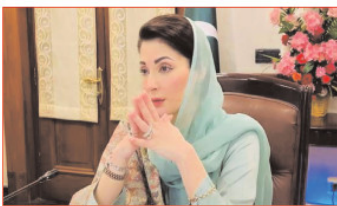
LAHORE: Punjab CM Maryam Nawaz has announced 1,224 flats for labourers in Taxila and Sundar labour colonies without any cost.

The Punjab CM also directed to pay Rs6 billion grants of death and marriage dues for labourers. Building of two hostels for women workers in garment