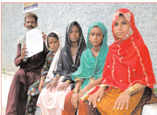
HYDERABAD: Residents of Tando Hyder are holding a protest demonstration for acceptance of their demands, at the Hyderabad press club.