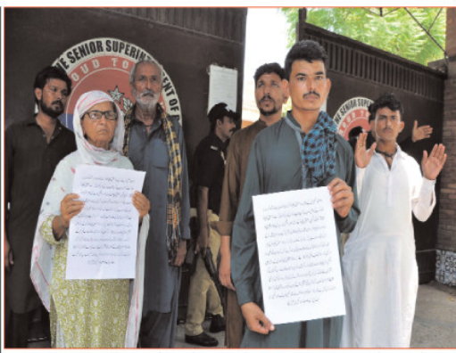
HYDERABAD: Residents of Husri are holding a protest demonstration outside the SSP's Office against their local police officials.