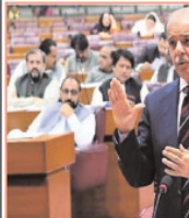
ISLAMABAD: Prime Minister Shehbaz Sharif on Wednesday told the National Assembly that the government had made no decision for the export of wheat.

"No decision has been made for the export of wheat. I want to bring it on record before the House that there is no such decision for the wheat export," he told the National Assembly responding to a point of order raised by a parliamentarian.