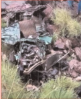
passengers were announced dead when they reached the hospital, as per the rescue officials.

MUZAFFARABAD: At least 15 people lost their lives and two were injured when a passenger jeep tumbled down from the Leswa Bypass Road near Devlian village onto the bank of the Neelum River on Wednesday while they were travelling from Lawat Bala to Muzaffarabad, Azad Jammu and Kashmir (AJK).