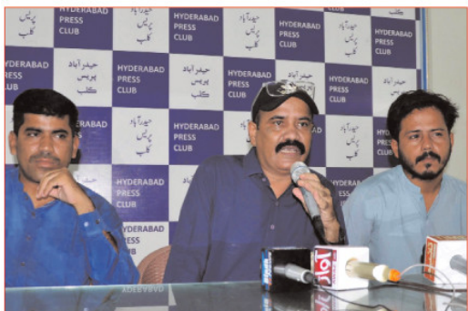
HYDERABAD: Residents of Hussainabad are holding a press conference for the acceptance of their demands, at the Hyderabad press club.