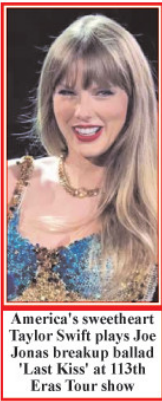
America's sweetheart Taylor Swift plays Joe Jonas breakup ballad 'Last Kiss' at 113th Eras Tour show