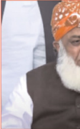
Maulana Fazur Rehman once again rejected the results of the general elections and demanded fresh polls, citing 'widespread rigging and irregularities'.

ISLAMABAD: Jamiat Ulema-e-Islam Fazl (JUI-F) Chief Maulana Fazur Rehman has advised Pakistan Tehreek-e-Insaf (PTI) to 'quit assemblies' and hit the street against the incumbent government, media reported on Wednesday, citing sources.