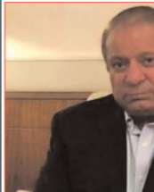
ISLAMABAD: Pakistan Muslim League - Nawaz (PML-N) supreme and party president Nawaz Sharif has sought relief for middle class in the electricity bills.

According to sources, the PML-N president in a meeting with Deputy Prime Minister Ishaq Dar, asked him to control inflation and give relief to the people in the extraordinary inflated electricity bills.