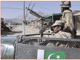
A scene of a gunfight in a rural area, with soldiers and debris visible.

"Sanitisation operation is being carried out to eliminate any terrorists found in the area," it said, noting that security forces of Pakistan were determined to eliminate the menace of terrorism from the country and such sacrifices of our brave sol-