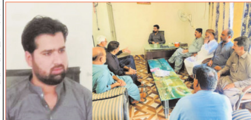
By Azhar Kubar