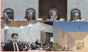
The Supreme Court's full bench led by Chief Justice Pakistan (CJP) Qazi Faez Isa has reserved its verdict regarding the Sunni Ittehad Council's (SIC) case on reserved seats.

"Their [Election Commission's] response on allegations of dishonesty regarding reserved seats for the Balochistan Awami Party was inadequately substanti-