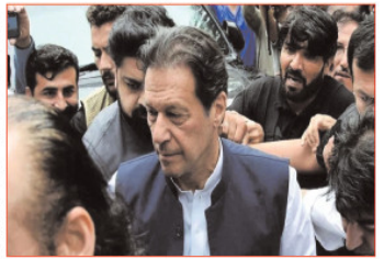
Imran Khan in a courtroom setting, surrounded by people.

The deposed prime minister, who was ousted from power in last session's no-confidence motion in April 2022, has been facing a slew of charges ranging from corruption to terrorism since