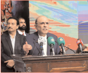
President Asif Ali Zardari speaking at a podium during a seminar.

Speaking on the occasion, the President highlighted that the social media had given power to the people by amplifying their voices, however, recent years had also witnessed a grouping in the media. He cautioned that a strong religious lobby in the world was manipulating and managing perceptions aiming to sow divisions in Muslim societies. He said that he was a supporter of the freedom of press and had always tolerated harsh criticism from the