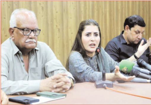
KARACHI: PPP's Central Information Secretary, Shazia Marri is addressing press conference held at the PPP Media Cell in Bilawal House.