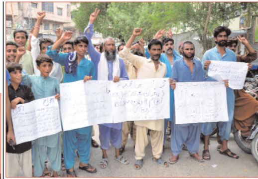
HYDERABAD: Residents of Tando Muhammad Khan are holding a protest demonstration at the Hyderabad press club against their local land mafia.