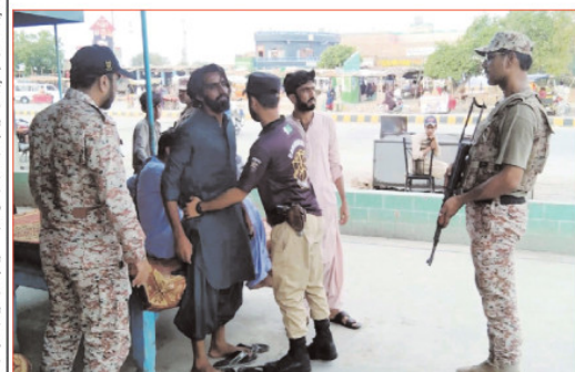
LARKANA: Rangers and Police officials are carrying out a combing search operation against criminals as security has been heightened in the city to maintain the law and order situation during the Holy Month of Muharram-ul-Haram.