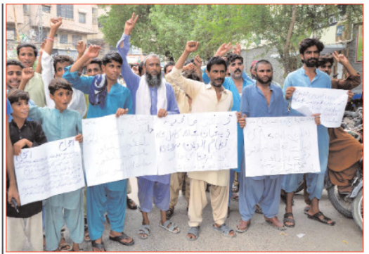
HYDERABAD: Residents of Tando Muhammad Khan are holding a protest demonstration at the Hyderabad press club against their local land mafia.