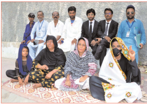
HYDERABAD: Residents of Husri are holding a protest demonstration at the Hyderabad press club against their area's influential persons.