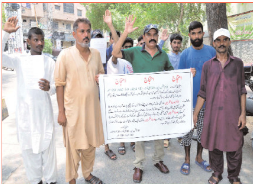
HYDERABAD: Residents of Hussainabad are holding a protest demonstration for the acceptance of their demands, at the Hyderabad press club.

As tensions simmered, Jacobabad's civil society rallied behind these demands, expressing solidarity in their struggle for essential services and relief from the severe electricity crisis gripping the city. They issued a stern warning, threatening to intensify their protests by besieging electricity company offices if their demands for immediate relief were not met. The protesters demanded immediate measures to alleviate the electricity crisis during