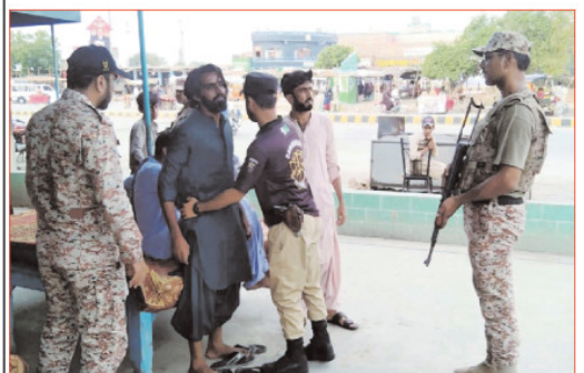
LARKANA: Rangers and Police officials are carrying out a combing search operation against criminals as security has been heightened in the city to maintain the law and order situation during the Holy Month of Muharram-ul-Haram.

Additionally, the Deputy Commissioner of Mirpurkhas was directed to oversee the completion of the city survey within 60 days and investigate any delays in the survey process, ensuring that responsible officers are held accountable.