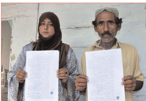
HYDERABAD: Residents of Manjhand are holding a protest demonstration against a robbery incident and their area police, at the Hyderabad press club.