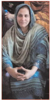
abad, Karachi South, Sukkur, and other remote areas of Sindh province.