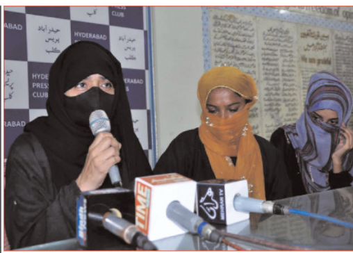
HYDERABAD: Women residents of Qasimabad are holding a press conference at the Hyderabad Press Club for the acceptance of their demands.