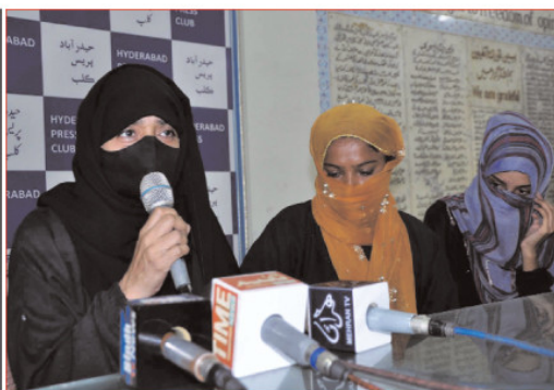
HYDERABAD: Women residents of Qasimabad are holding a press conference at the Hyderabad Press Club for the acceptance of their demands.