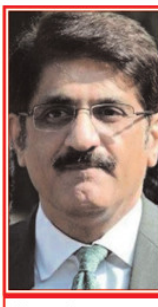
Sindh CM Engages World Bank In Bold Keenjhar Lake Expansion Talks