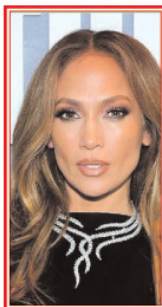
Jennifer Lopez to witness 'ugliest' fate after Ben Affleck divorce