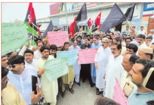
NAUNDERO: Activists and leaders of the PPP Peoples Party are holding a protest rally to mark 5th July, 1977 as a Black Day, in Naundero.

"Manchar's Kacho," a 182-square-kilometer stretch that experiences recurring floods. The devastating floods of 2022 caused extensive damage, displacing homes, destroying millions of acres of crops and resulting in significant property losses. The government's assistance has been minimal, providing only Rs 300,000 to build a single room for the affected families, a scheme that is now in its third year. The leaders expressed their disappointment over the lack of comprehensive government support. After the last flood, the Manchar Rehabilitation Movement organized a high-level conference in Sehwan, involving water experts, relevant government officials, civil society members and World Bank representatives. The conference aimed to provide useful recommendations for aiding flood victims and restoring Manchar Lake. The leaders urged the Sindh Government to strengthen