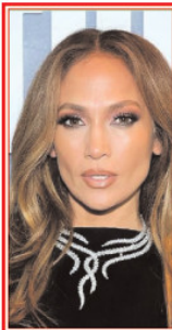
Jennifer Lopez to witness 'ugliest' fate after Ben Affleck divorce