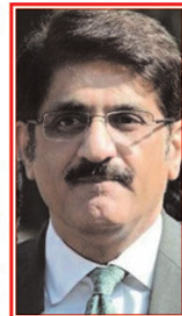
Sindh CM Engus World Bank In Bold Keenjhar Lake Expansion Talks