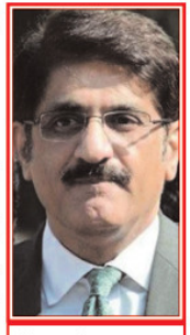
Sindh CM Engus World Bank In Bold Keenjhar Lake Expansion Talks