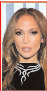
Jennifer Lopez to witness 'ugliest' fate after Ben Affleck divorce