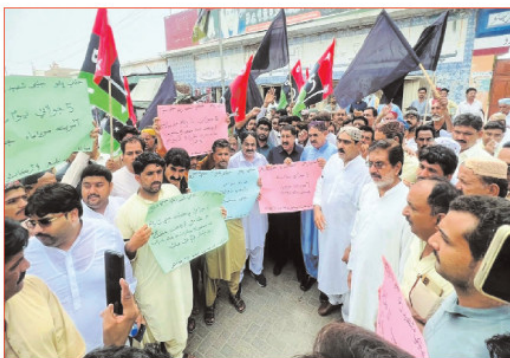
NAUNDERO: Activists and leaders of the PPP Peoples Party are holding a protest rally to mark 5th July, 1977 as a Black Day, in Naundero.