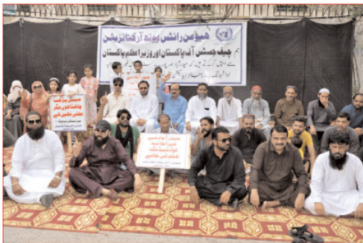
HYDERABAD: Members and leaders of Human Rights Youth Organization are holding a protest demonstration at the Hyderabad Press Club against prolonged electricity load shedding and over billing of electricity bills.