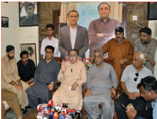
HYDERABAD: Former PPP Federal Minister Moulana Bux Chandio along with other party leaders is addressing a press conference.-RT