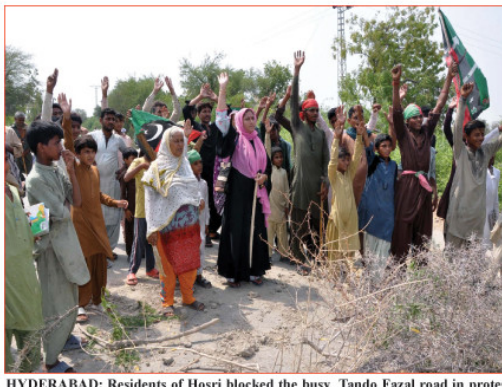
HYDERABAD: Residents of Hosri blocked the busy Tando Fazal road in protest against their area police.