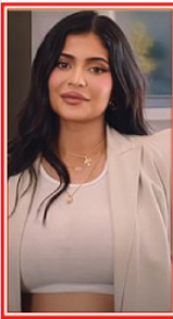
Kylie Jenner keeps Timothee Chalamet away from 'Kardashians' reality TV