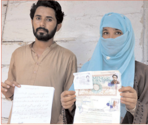
HYDERABAD: Moro newlyweds who were married on their freewill are protesting at the Hyderabad press club for the provision of protection to them.