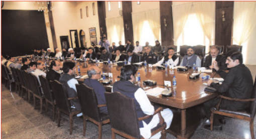
KARACHI: Sindh Chief Minister, Syed Murad Ali Shah presides over a joint meeting with the administration and religious scholars to finalize arrangements for Muharram-ul-Haram, held at the CM House.