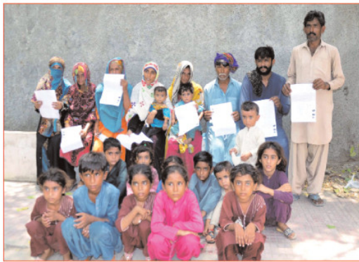
HYDERABAD: Residents of Jhando Khoso are holding a protest demonstration at the Hyderabad press club against the influential people of their area.-RT