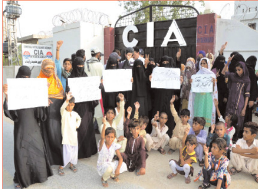
HYDERABAD: Residents of Chang Goth are holding a protest demonstration against their area police.