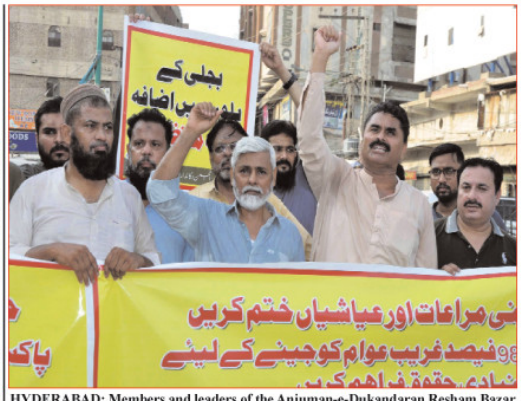
HYDERABAD: Members and leaders of the Anjuman-e-Dukandaran Resham Bazar are holding a protest demonstration at Kohinoor Chowk against load shedding of electricity and inflated electric bills.