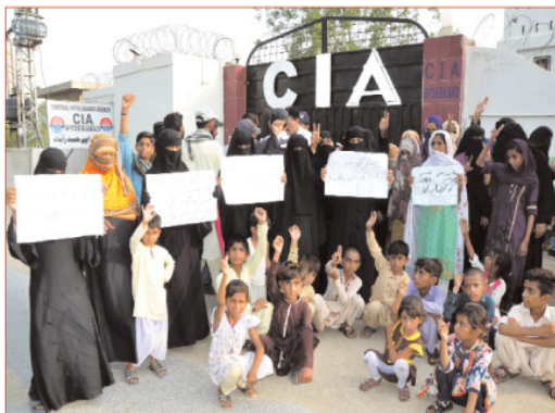
HYDERABAD: Residents of Chang Goth are holding a protest demonstration against their area police.

including the Chief Minister of Sindh Murad Ali Shah, the Chief Justice of Pakistan, and Prime Minister Shahbaz Sharif. They appealed to the High Court to reconsider its decision. The candidates asserted that they took the test with complete honesty and were selected on merit. They opposed the idea of retaking the test, emphasizing that the previous test was conducted fairly and under the credible supervision of IBA, a reputable institution. They called for any negligence by responsible authorities to be addressed without jeopardizing the candidates' future.