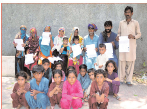
HYDERABAD: Residents of Jhando Khoso are holding a protest demonstration at the Hyderabad press club against the influential people of their area.-RT