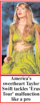
America's sweetheart Taylor Swift tackles 'Eras Tour' malfunction like a pro