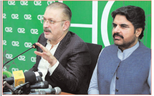
KARACHI: Senior Sindh Minister for Information, Transport and Mass Transit, Excise Taxation and Narcotics Control, Sharjeel Inam Memon is addressing the media against Khalid Maqbool Siddiqui's comments against Shaheed Zulfikar Ali Bhutto.

Pakistan, along with exhibitors from Pakistan's textile sector. The discussions centered on potential joint ventures, leveraging the niche expertise of Pakistan in finished textiles. The Pakistani representatives highlighted tariff issues and the need for streamlined banking channels to enhance trade. Both parties agreed to expand the reach of Pakistani textile products across Central Asia. The government-to-government interactions during the event have laid the foundation for stronger trade and economic relations between Pakistan and Uzbekistan, as well as with the broader Central Asian region.