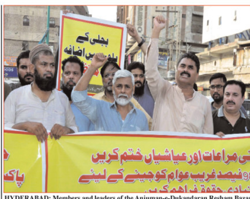
HYDERABAD: Members and leaders of the Anjuman-e-Dukandaran Resham Bazar are holding a protest demonstration at Kohinoor Chowk against load shedding of electricity and inflated electric bills.