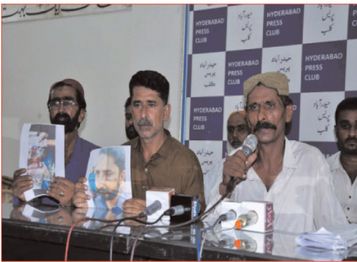
HYDERABAD: Residents of Sehrish Nagar are holding a press conference at the Hyderabad Press Club for the acceptance of their demands.-RT