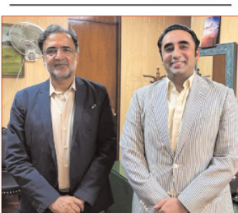
ISLAMABAD: PPP CEC Member and Former Federal Minister Qamar Zaman Kaira Central Executive called on PPP Chairman Bilawal Bhutto Zardari at his office in Parliament House to discuss the political situation in Punjab province.