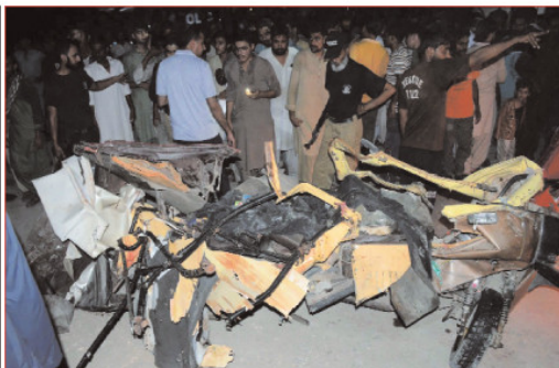
HYDERABAD: A view of the site of a deadly traffic accident due to a horrific collision between a trailer, rickshaw and motorbike due to over speeding, in the Latifabad area of the city.-RT

In his address, SSP Abid Baloch announced the formation of a district-level peace committee dedicated to maintaining peace and fostering interfaith harmony throughout Muharram. "We