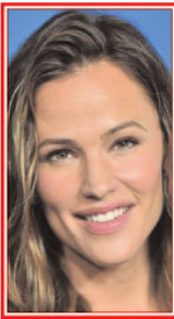
Jennifer Garner wants Ben Affleck to live with her amid Jennifer Lopez divorce