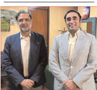
ISLAMABAD: PPP CEC Member and Former Federal Minister Qamar Zaman Kaira Central Executive called on PPP Chairman Bilawal Bhutto Zardari at his office in Parliament House to discuss the political situation in Punjab province.