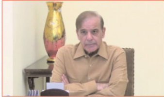
leged that ever since then, he had been encountering various incidents, such as firing outside his ATC and questioning from family members, among others.