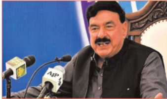
why the government will certainly try to keep him behind bars as long as possible," the PM's adviser said while speaking on Geo News programme 'Aaj Shahzeb Khanzada Kay Saath' on Tuesday.

"Imran Khan's main agenda is to destabilise the country and spread chaos and anarchy in the country that's