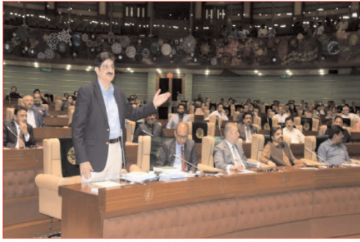
KARACHI: Sindh Chief Minister, Syed Murad Ali Shah is concluding the debate on the budget for 2024-25 during provincial assembly session, at the Sindh Assembly building.—RT

Karachi Commissioner Hasan Naqvi disclosed that ten individuals succumbed to heatstroke earlier in the week, underscoring ongoing challenges despite the recent weather change. The maximum recorded temperature in Karachi reached 42°C on Monday and 41°C on Sunday, highlighting the severity of the recent heatwave.—RT/Agency