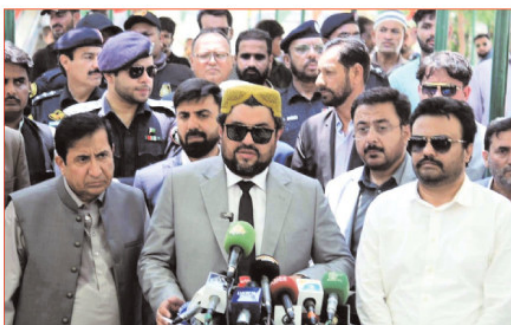
KARACHI: Governor Sindh, Kamran Tessori is addressing the media after laying a floral wreath and offering Fateha at the shrine of Hazrat Abdullah Shah Ghazi (RA) on the occasion of the revered Saint's 1294th Annual Urs celebrations during his visit at his shrine.