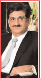
Women To Drive Pink Buses Soon In Sindh: Murad