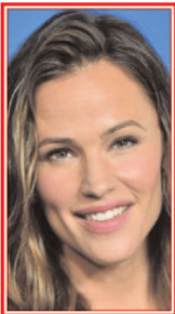
Jennifer Garner wants Ben Affleck to live with her amid Jennifer Lopez divorce