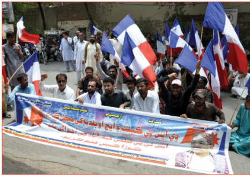
HYDERABAD: Activists and leaders of the Sindh Taraqi Pasand Party (STP) are holding a protest demonstration against their local police officials, outside the SSP's office. RT