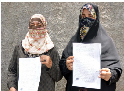
HYDERABAD: Residents of Halanaka are holding a boisterous protest demonstration at the Hyderabad press club against their local land grabbers. RT