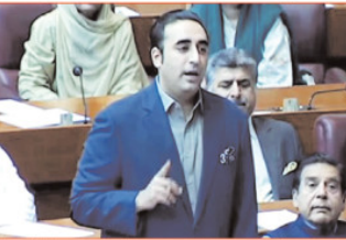
Sharif-led party. A day earlier, sources said the PML-N accepted all demands of its major ally.

Both the parties held several rounds of talks during which the PPP shared its grievances with the Shehbaz