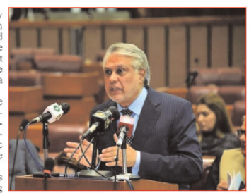
The foreign minister expressed Pakistan's desire for good relations with India based on mutual respect, sovereignty equality, and a peaceful resolution of the Jammu and Kashmir dispute, rejecting unilateral approaches or attempts at hegemony.

Rashid in person was present in the courtroom to hear the judgement.