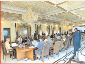
privatisation while ensuring transparency in the process.

He said the government was planning to put the national economy on a positive trajectory and expressed sat-