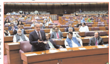
and employment opportunities exceeding the region's population ratio.

Emphasising his administration's commitment to regional development, the premier underscored initiatives aimed at uplifting southern Punjab.