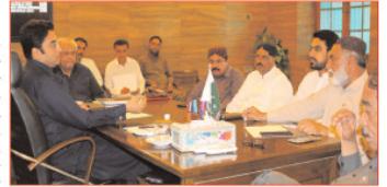
By Samad Ayaz

NAWABSHAH: Deputy Commissioner Gul Memon presided over a crucial meeting at his office to assess the readiness of drains and canals ahead of the upcoming monsoon rains, aiming to ensure efficient water drainage during the rainy season. The meeting focused on proactive measures to safeguard residents and farmers from potential flood risks exacerbated by climate change. Deputy Commissioner Memon directed officials from the LBOD (Left Bank Outfall Drain) to develop comprehensive plans for water drainage, taking into account forecasts of above-average rainfall. Emphasis was placed on maintaining cleanliness at drainage points and ensuring uninterrupted electricity supply at pumping stations. Immediate actions were mandated to swiftly drain rainwater from Nawabshah city, surrounding areas, and the airport. Furthermore, a request will be submitted to the PDMA (Provincial Disaster Management Authority) for urgent deployment of machinery to channel rain-