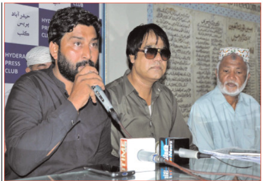
HYDERABAD: Residents of SITE area are addressing a press conference at the Hyderabad press club for the provision of justice-RT

KUMB: On the 18th of Dhulhaj, in celebration of Eid Ghadir, the Shia community of Kotdiji organized a grand rally that commenced from Masjid Ali al-Murtaza in Kot Bungalow. The rally, which witnessed the participation of thousands of devotees, expressed their deep love and reverence for Hazrat Imam Ali (AS). As the rally made its way through the Shahi Bazaar, Kotdiji, a spirit of devotion and collective joy, making it a memorable event for all attendees.