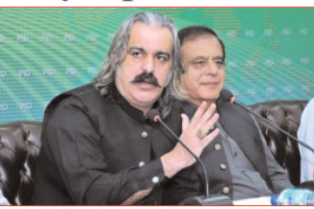
re-energised national counter-terrorism drive, to turn up the heat on militants targeting the state of Pakistan.

During a meeting of the Apex Committee, Prime Minister Shehbaz Sharif last Saturday gave the go-ahead to operation Azm-e-Istehkam, a reintegrated and