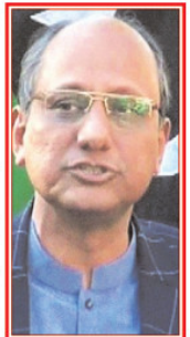
Ghani Takes Action On Liaquatabad Building Collapse

David Warner quietly concludes illustrious international cricket career