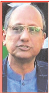
Ghani Takes Action On Liaquatabad Building Collapse