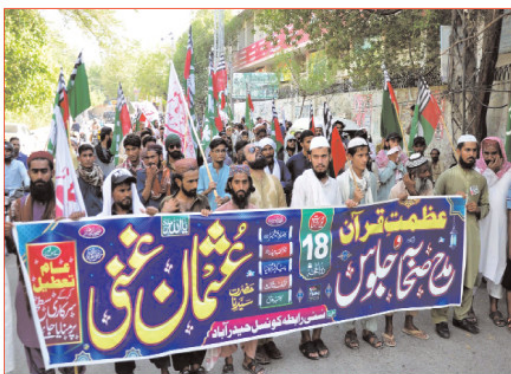
HYDERABAD: Members and leaders of the Sunni Rabta Council are observing the martyrdom day of Hazrat Usman Ghani, at the Hyderabad press club-RT