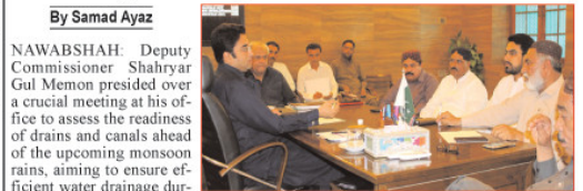
By Samad Ayaz