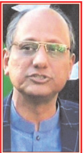
Ghani Takes Action On Liaquatabad Building Collapse

David Warner quietly concludes illustrious international cricket career