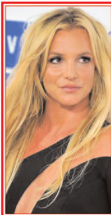
Britney Spears says goodbye to powerhouse attorney Mathew Rosengart