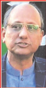
Ghani Takes Action On Liaquatabad Building Collapse