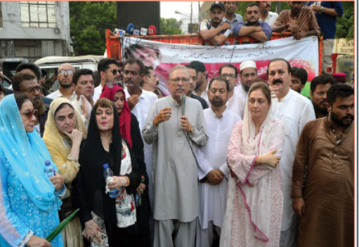
KARACHI: Leaders and activists of PTI are holding a protest demonstration at the Karachi press club for Inmran Khan's release.

the suspension of power transmission," he added. The spokesperson alleged that the protesters also clashed with PESCO staff, using abusive language and snatching mobile phones. "PESCO teams are currently working to repair the damage, and it may take several hours to restore power supply," he added. The constant interference by protesters has increased the difficulties of PESCO consumers, the spokesperson added. /Agency