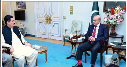
ISLAMABAD: Prime Minister Muhammad Shehbaz Sharif is exchanging views with Khyber Pakhtunkhwa Governor, Faisal Karim Kundi during their meeting at the PM House.