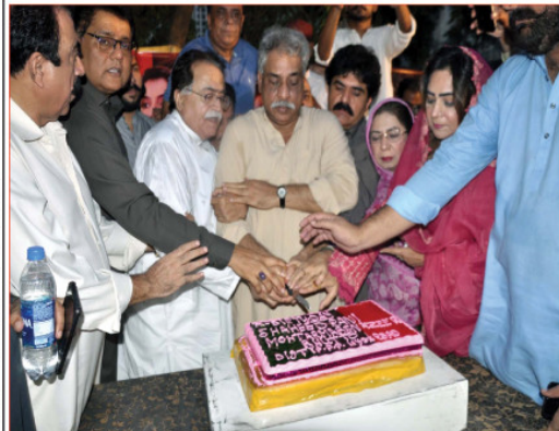
HYDERABAD: Leaders and members of the PPP are cutting a cake to celebrate the 71st birthday anniversary of Shaheed Benazir Bhutto.