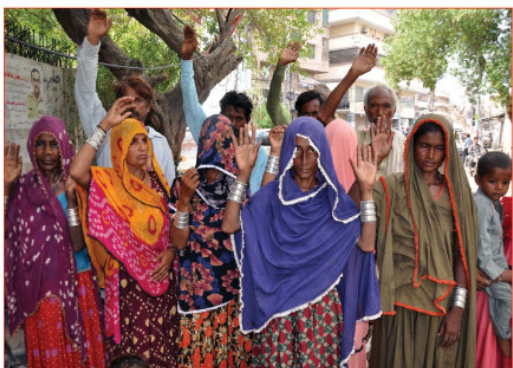
HYDERABAD: Residents of Matari District are holding a protest demonstration against a rape and their area's police officials, at the Hyderabad press club.