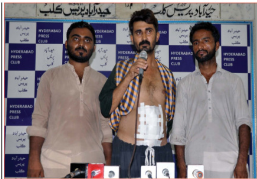
HYDERABAD: Residents of Badin District are holding a press conference for the acceptance of their demands, at the Hyderabad press club.