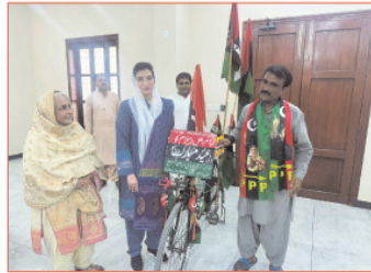
By Farooq Junejo