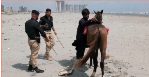
KARACHI: Police officials are dispersing people from Sea View Beach due to an ongoing ban on entering the sea.

The CM directed the Livestock Department to ensure proper care for the injured animals and to keep him updated on their progress. He also stressed the importance of providing justice for the animals and taking strict action against those responsible for their abuse.