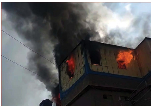
KARACHI: Huge fire and dark smoke are rising from a factory fire in the SITE area of the city.—RT

Faisalabad deputy commissioner has also formed a committee to investigate the orders of CM Maryam, who vowed exemplary punishment for those found responsible.—RT/Agency