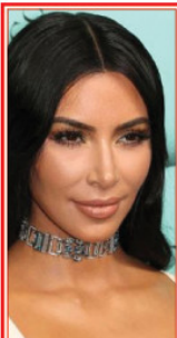
Kim Kardashian urges fans to 'must see' Celine Dion's documentary