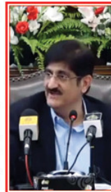
Three Veterinary Hospitals To be Upgraded With Indoor Facilities: CM Murad