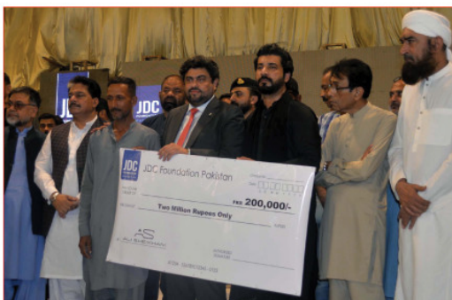
HYDERABAD: Sindh Governor Kamran Khan Tessori is distributing relief cheques among victims of the Paretabad gas cylinder blast incident during a relief cheques distribution ceremony organized by the JDC Foundation.