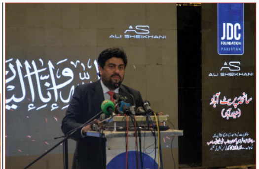
HYDERABAD: Sindh Governor, Kamran Khan Tessori addresses during relief cheques distribution ceremony among victims of Paretabad gas cylinder blast incident organized by JDC Foundation, held.