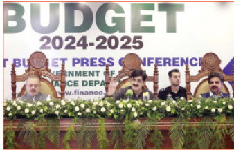
BUDGET 2024-2025 BUDGET PRESS CONFERENCE Growth Target: Acknowledged the failure to meet growth targets, aiming for a 3.5% growth target next fiscal year despite challenges.

KARACHI: Sindh Chief Minister Murad Ali Shah blamed the caretaker government for delays in the province's development schemes, emphasizing that his administration will focus on completing existing projects using the 2024-25 budget. Delay in Projects: CM Murad criticized the caretaker government for shutting down development schemes, resulting in delays. Budget Focus: The 2024-25 budget will prioritize completing old projects and initiatives.