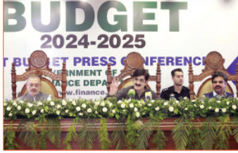
BUDGET 2024-2025 BUDGET PRESS CONFERENCE Growth Target: Acknowledged the failure to meet growth targets, aiming for a 3.5% growth target next fiscal year despite challenges.

KARACHI: Sindh Chief Minister Murad Ali Shah blamed the caretaker government for delays in the province's development schemes, emphasizing that his administration will focus on completing existing projects using the 2024-25 budget. Delay in Projects: CM Murad criticized the caretaker government for shutting down development schemes, resulting in delays. Budget Focus: The 2024-25 budget will prioritize completing old projects and initiatives.