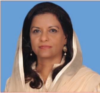
Dr. Nafisa Shah further stated that education is the guarantee of a bright future. Khairpur is the only district where the flame of knowledge is burning.

KUMB: The central leader of Pakistan People's Party and MNA, Dr. Nafisa Shah Jilani, while expressing her thoughts to the workers, said that she represents Sindh in the center and holds the interests of Sindh dear. The Pakistan People's Party has always advocated for the rights of the poor, farmers and laborers. The reason for aligning with the government is solely to address the issues faced by Sindh. Chairman Bilawal Bhutto is tirelessly working day and night to provide employment to the youth, reduce inflation, and alleviate the problems faced by farmers.