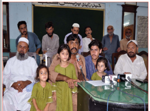
HYDERABAD: Residents of Laal Quarters are holding a press conference at the Hyderabad Press Club against their area police officials.—RT