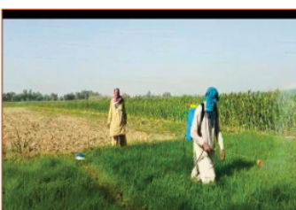
By Shad Mahar Ghotki. In this regard it was learned that cultivation of rice

GHOTKI: The Assistant Commissioner of Ghotki district due to which the AC destroyed the standing crops of the people which had been launched an operation against the rice cultivated in government orders.