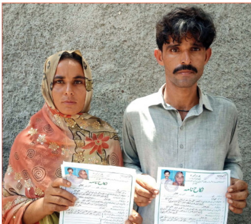
HYDERABAD: Khairpur Mirs' newlyweds are protesting for the provision of protection, at the Hyderabad press club.