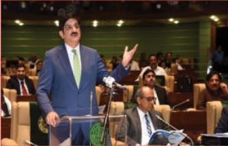
Rs269 billion, and provincial non-tax receipts of Rs42.9 billion.

KARACHI: Sindh Chief Minister Syed Murad Ali Shah on Friday presented a Rs3.056 trillion budget for the next fiscal year 2024-25, proposing up to 30% massive increase in the salaries of government employees. Besides the salary hike, the budget also includes a significantly higher development expense of Rs959 billion, which accounts for 31% of the outlay. The "balanced" budget mainly centers around the rehabilitation of flood-affected people and social protection for the poor. The majority of the total projected revenue for the province comes from the 62% federal transfers, followed by 22% provincial receipts. As per the budgetary document released by the provincial government, the remaining receipts are through current capital receipts of Rs22 billion, foreign project assistance of Rs334 billion, other federal grants in the form of Public Sector Development Programme's (PSDP) Rs77 billion, foreign grants of Rs6 billion and a carryover cash balance of Rs55 billion. Provincial receipts of Rs662 billion comprise sales tax on services of Rs350 billion, tax excluding GST of