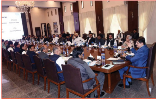
KARACHI: Sindh Chief Minister, Syed Murad Ali Shah is presiding over a pre-budget cabinet meeting at the CM House.