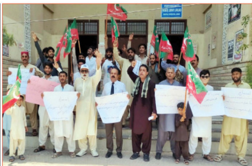
LARKANA: Activists and leaders of PTI are holding a protest demonstration at Jinnah Bagh for Imran Khan's release.

GHOTKI: The Assistant Commissioner of Ghotki district due to which the AC destroyed the standing crops of the people which had been launched an operation against the rice cultivated in government orders.