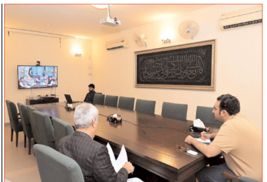
KARACHI: PPP Chairman, Bilawal Bhutto Zardari is being briefed by video link by Sarfraz Bugti, Balochistan Chief Minister on his government's performance, future plans and other measures regarding solving public problems in the province.—RT