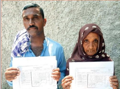
HYDERABAD: Residents of Phuleli are holding a protest demonstration at the Hyderabad press club against their area's land grabbers.