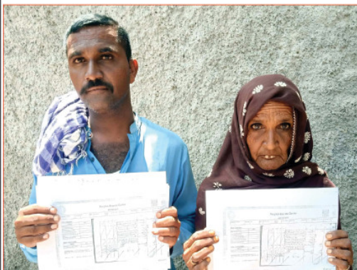
HYDERABAD: Residents of Phuleli are holding a protest demonstration at the Hyderabad press club against their area's land grabbers.