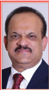
KATI Slams Federal Budget Over Industrial Sector Snub