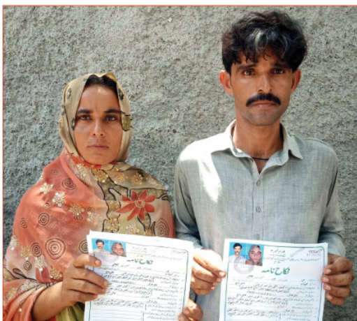
HYDERABAD: Khairpur Mirs' newlyweds are protesting for the provision of protection, at the Hyderabad press club.