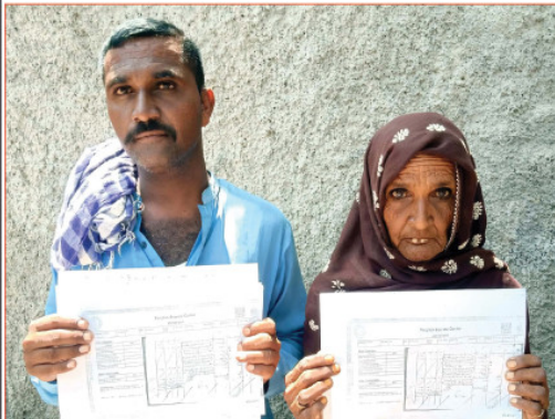
HYDERABAD: Residents of Phuleli are holding a protest demonstration at the Hyderabad press club against their area's land grabbers.-RT