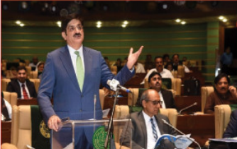
Rs269 billion, and provincial non-tax receipts of Rs42.9 billion.

KARACHI: Sindh Chief Minister Syed Murad Ali Shah on Friday presented a Rs3.056 trillion budget for the next fiscal year 2024-25, proposing up to 30% massive increase in the salaries of government employees. Besides the salary hike, the budget also includes a significantly higher development expense of Rs959 billion, which accounts for 31% of the outlay. The "balanced" budget mainly centers around the rehabilitation of flood-affected people and social protection for the poor. The majority of the total projected revenue for the province comes from the 62% federal transfers, followed by 22% provincial receipts. As per the budgetary document released by the provincial government, the remaining receipts are through current capital receipts of Rs22 billion, foreign project assistance of Rs334 billion, other federal grants in the form of Public Sector Development Programme's (PSDP) Rs77 billion, foreign grants of Rs6 billion and a carryover cash balance of Rs55 billion. Provincial receipts of Rs662 billion comprise sales tax on services of Rs350 billion, tax excluding GST of