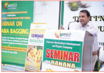
PHDEC's $52 million banana export in 2023.

HYDERABAD: The Pakistan Horticulture Development & Export Company (PHDEC) has launched a pilot project aimed at improving Pakistan's banana exports through the distribution of banana bunch bags to progressive growers in the Hyderabad region. This initiative seeks to enhance banana quality and cosmetic appeal, facilitating access to lucrative international markets. PHDEC continues its commitment to advancing Pakistan's horticulture sector by improving product quality to boost exports.