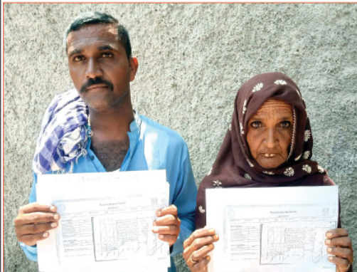
HYDERABAD: Residents of Phuleli are holding a protest demonstration at the Hyderabad press club against their area's land grabbers.