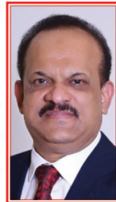
KATI Slams Federal Budget Over Industrial Sector Snub