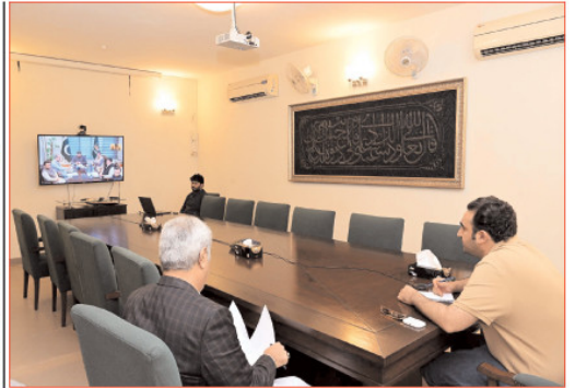
KARACHI: PPP Chairman, Bilawal Bhutto Zardari is being briefed by video link by Sarfraz Bugti, Balochistan Chief Minister on his government's performance, future plans and other measures regarding solving public problems in the province.

The shopkeeper in a statement claimed to have been robbed of Rs 70,000 in the incident, revealing that the same people robbed his shop on the 2nd of the current month. It is pertinent to mention here that the local police arrested the DSP and his son after the police vehicle allocated to the police official used in the robbery at a shop in Karachi. The police arrested the DSP, his son who allegedly used the police vehicle to commit a robbery in the Gulshan Iqbal area of Karachi. As per the statement