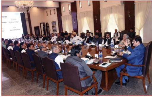
KARACHI: Sindh Chief Minister, Syed Murad Ali Shah is presiding over a pre-budget cabinet meeting at the CM House.