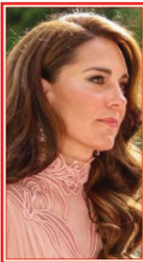
Kate Middleton addresses the public for the second time on cancer battle