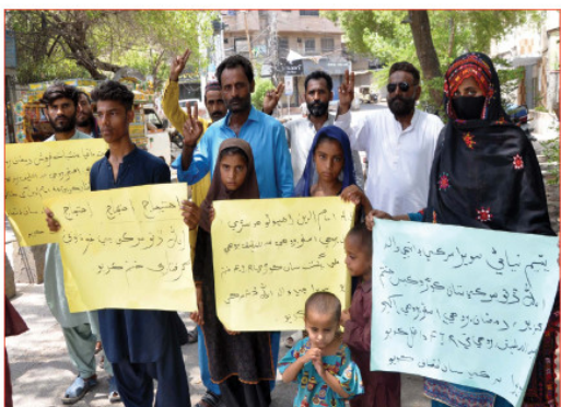
HYDERABAD: Residents of the SITE area are holding a protest demonstration against the Hyderabad press club against their area's drug dealers.