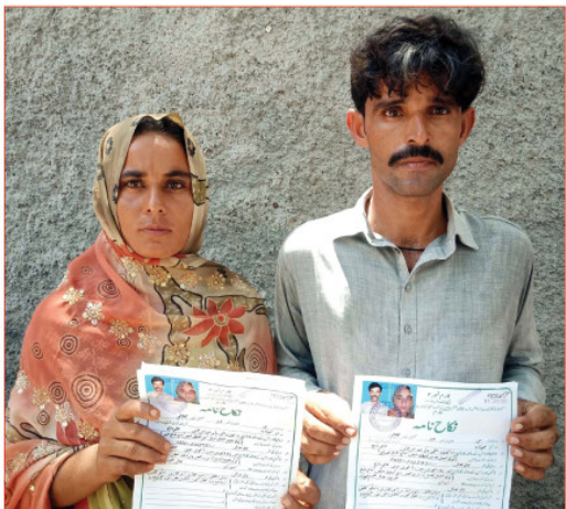
HYDERABAD: Khairpur Mirs' newlyweds are protesting for the provision of protection, at the Hyderabad press club.-RT