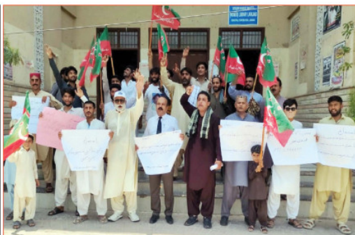
LARKANA: Activists and leaders of PTI are holding a protest demonstration at Jinnah Bagh for Imran Khan's release.