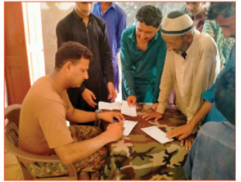
By Sajid Ali Janyaro

KETI BANDAR: The collaboration between the Pak Army, the Health Department Thatta and MERF Thatta in organizing a one-day free medical camp in Keti Bandar is a commendable effort to address the healthcare needs of the local population. The camp provided essential medical services to residents who often lack access to such facilities. The presence of dedicated healthcare professionals, including dermatologists, and access to clean water,