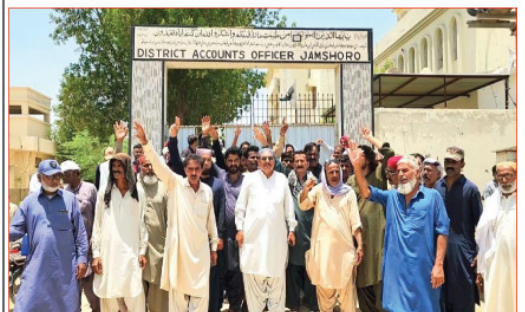
By Shaikh Sindh

KOTRI: The employees of the Sindh Irrigation Department Center, Kotri Barrage, Lower Sindh, Mechanical Workshop staged a protest in front of the Treasury Office against the non-processing of bills continuously committing employees of the irrigation department. He harasses them in various ways for the verification of bills, demands hefty bribes, and refuses to stamp or verify bills if the bribe is not removed from his position.