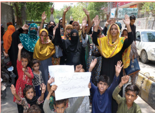
HYDERABAD: Residents of Tando Hyder are holding a protest demonstration at the Hyderabad press club against their area police officials.

Those who pay the bribe get their bills verified quickly, while the poor, helpless employees are made to wait for months. The market for bribes is flourishing, and despite numerous written complaints to the District Accounts Officer, no action has been taken. They have been forced to protest and demand that the issues of the irrigation department employees be being immediately and