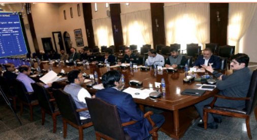
KARACHI: Sindh Chief Minister, Syed Murad Ali Shah is presiding over a meeting at the CM House to review the overall law and order situation of the province.