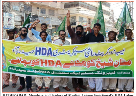
HYDERABAD: Members and leaders of Muslim League Functional's HDA Labor Wing are holding a protest demonstration for the acceptance of their demands, at the Hyderabad press club.-RT