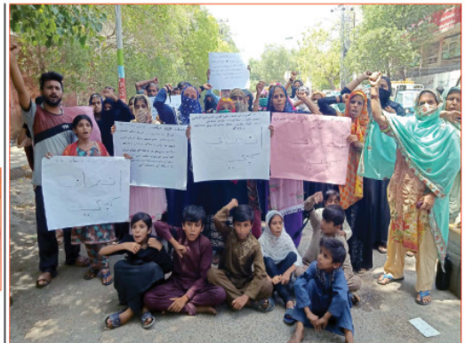
HYDERABAD: Residents of Bachal Bhatti Goth are holding a protest demonstration against their area's land grabbers, at the Hyderabad press club.