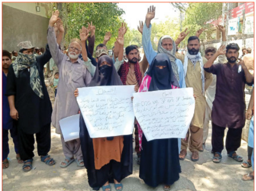
HYDERABAD: Residents of Kotri are holding a protest demonstration against at the Hyderabad press club against their area police officials.