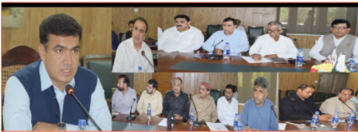
By Absar Alvi

SUKKUR: During Eid-ul-Azha, strict action will be taken against unauthorized slaughter of sacrificial animals in Sukkur District. A complete ban has been imposed on establishing makeshift cattle markets without permission letters in place.