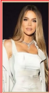
Khloe Kardashian agrees to become Malika Haqq's 'baby daddy'