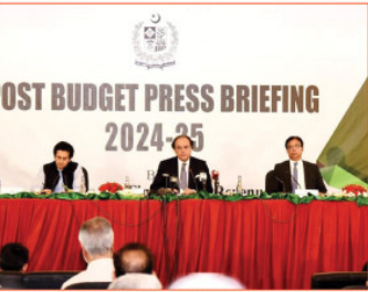
The minister admitted that the Federal Board of Revenue (FBR) had not achieved the level of compliance and enforcement it should have.

He also underscored the importance of eliminating the undocumented economy with end-to-end digitalisation to reduce human intervention as much as possible, make the tax mechanism transparent, and mitigate the chances of corruption.