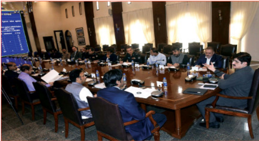
KARACHI: Sindh Chief Minister, Syed Murad Ali Shah is presiding over a meeting at the CM House to review the overall law and order situation of the province.