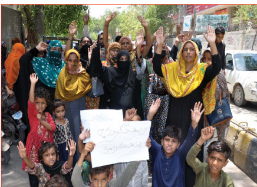
HYDERABAD: Residents of Tando Hyder are holding a protest demonstration at the Hyderabad press club against their area police officials.

Those who pay the bribe get their bills verified quickly, while the poor, helpless employees are made to wait for months. The market for bribes is flourishing, and despite numerous written complaints to the District Accounts Officer, no action has been taken. They have been forced to protest and demand that the issues of the irrigation department employees be being immediately and verified immediately and demands hefty bribes, and refuses to stamp or verify bills if the bribe is not removed from his position.