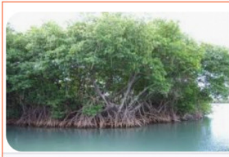
By Khuda Bux Brohi

THATTA: The destruction of mangrove trees along Pakistan's coastline, which are crucially planted by the Environmental Department, Forest officials and NGOs, continues despite their importance in enhancing the environment and serving as a natural defense against tsunamis and cyclones. They also provide vital habitats for aquatic life. Despite public outcry, illegal chopping of mangroves persists, with allegations suggesting complicity of some officials, which undermines efforts to protect these essential ecosystems. In an attempt to strengthen mangrove forests, environmentalists, civil society activists, and representatives from growers' organizations gathered on Khedewari Island along the Keti Bunder coastline. On July 15, 2009, they set a Guinness World Record by planting 451,176 'Rhizophora mucronata' mangrove saplings in a single day.