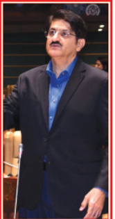
Murad Acquires State-Of-The-Art E-Tagging Devices And Drones To Combat Crime In Sindh