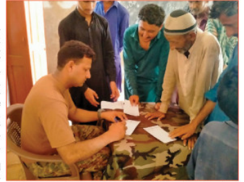
By Sajid Ali Janyaro

KETI BANDAR: The collaboration between the Pak Army, the Health Department Thatta and MERF Thatta in organizing a one-day free medical camp in Keti Bandar is a commendable effort to address the healthcare needs of the local population. The camp provided essential medical services to residents who often lack access to such facilities. The presence of dedicated healthcare professionals, including dermatologists, and access to clean water,