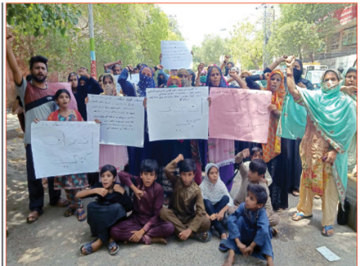
HYDERABAD: Residents of Bachal Bhatti Goth are holding a protest demonstration against their area's land grabbers, at the Hyderabad press club.-RT