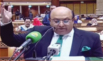
He said Minority Development Fund has been increased by Rs1 billion for first time and Rs6 billion were earmarked for laptop scheme while Rs5 billion for the Pakistan Kidney and Liver Transplant Institute Endowment Fund.

The Punjab finance minister said minimum wages were enhanced from 32,000 to 37,000 in the budget and the salaries of government employees will be increased by up to 25%.