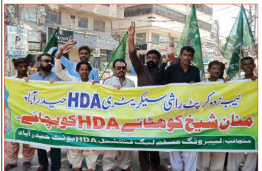
HYDERABAD: Members and leaders of Muslim League Functional's HDA Labor Wing are holding a protest demonstration for the acceptance of their demands, at the Hyderabad press club.-RT