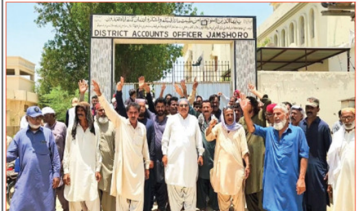
By Shaikh Sindh

KOTRI: The employees of the Sindh Irrigation Department Center, Kotri Barrage, Lower Sindh, Mechanical Workshop staged a protest in front of the Treasury Office against the non-processing of bills continuously committing employees of the irrigation department. He harasses them in various ways for the verification of bills, demands hefty bribes, and refuses to stamp or verify bills if the bribe is not removed from his position.