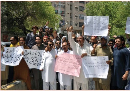
HYDERABAD: Members and leaders of the All Hyderabad LPG Gas Distributors Association are holding a protest demonstration for acceptance of their demands, at the Hyderabad press club.