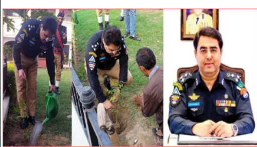
By Asif Qureshi

KARACHI: Planting trees is a continuous act of charity that not only shields humans from pollution but also aids in preventing diseases by ensuring a supply of fresh air. These were the sentiments expressed by DIG East Zone Captain (R) Ghulam Azfar Mahesar also made a public appeal, calling on citizens to join the tree plantation campaign. He highlighted the collective responsibility of the community in combating pollution and enhancing the beauty of Karachi.