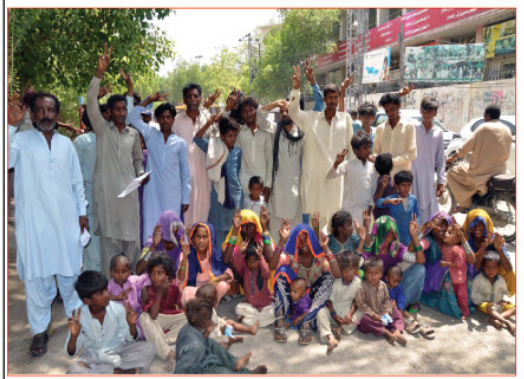
HYDERABAD: Residents of Tando Muhammad Khan are holding a protest demonstration at the Hyderabad press club for the provision of justice.