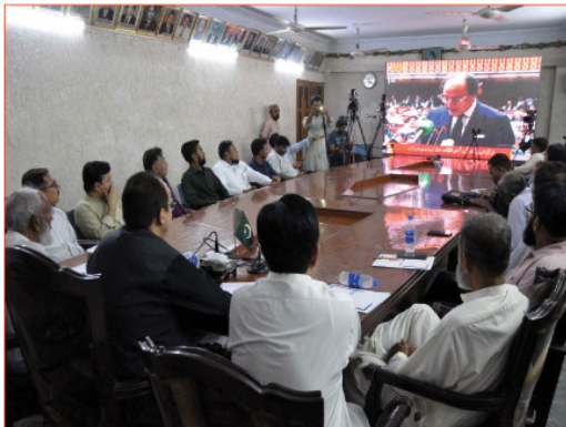
HYDERABAD: Members and leaders of the local business community are listening to the finance minister's budget speech, at the HCCL-RT