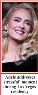
Adele addresses 'stressful' moment during Las Vegas residency