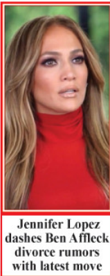
Jennifer Lopez dashes Ben Affleck divorce rumors with latest move