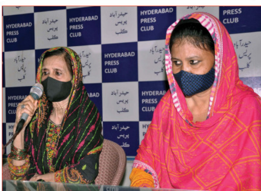
HYDERABAD: Women residents of Latifabad are holding a press conference at the Hyderabad Press Club for the acceptance of their demands.