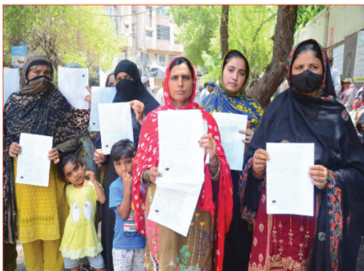
HYDERABAD: Residents of Tando Saeed Khan are holding a protest demonstration at the Hyderabad Press Club for the acceptance of their demands.