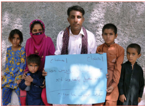
HYDERABAD: Residents of Gorakh Hills are holding a protest demonstration at the Hyderabad Press Club for the acceptance of their demands.