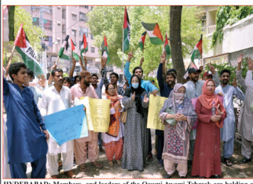
HYDERABAD: Members and leaders of the Qaumi Awami Tehreek are holding a protest demonstration at the Hyderabad Press Club against ongoing Israeli atrocities in Gaza.