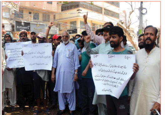
HYDERABAD: Employees of Paretabad Town are holding a protest demonstration at the Hyderabad Press Club against the non-payment of their salaries.-RT