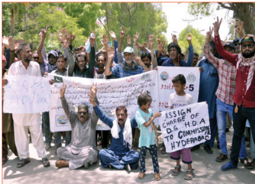
HYDERABAD: Members and leaders of the HDA Labor Union are holding a protest demonstration at the Hyderabad Press Club against the non-payment of their salaries and pensions.-RT