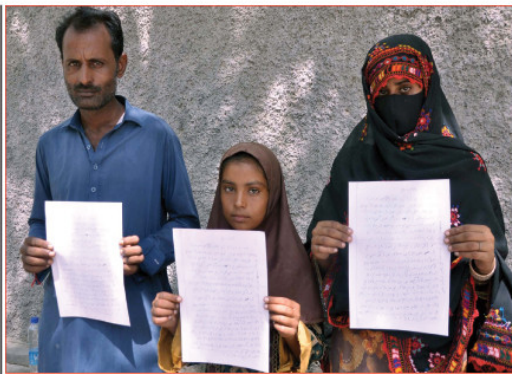
HYDERABAD: Residents of Ganjo Takkar are holding a protest demonstration at the Hyderabad Press Club against the influential police officials of their area.