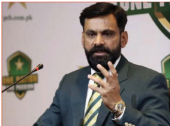
time while this was Amir's first international tournament after returning to cricket. "Who was the best bowler? For me, it would be Naseem Shah and then Shaheen Shah Afridi. Amir was away from Pakistan cricket for four years. Don't try to compare international T20 leagues to international cricket. You didn't trust your main player and trusted someone who is making a comeback after four years," Hafeez said. The former cricketer also slammed the team for not being able to keep their nerves together and lost to a team with not much international experience as Pakistan. "How did Pakistan lose not one, but two matches in a day? First, we lost the 20-over game and then the super over. We understand you were nervous. It was a nervous batting innings, it was nervous bowling and fielding. I understand it in the 20-over game. But you couldn't control your nerves in a Super Over?" he concluded. Pakistan now play arch-rivals India next on June 9 in New York, should they suffer another defeat, their chances of qualifying for the World Cup Super 8 would be little to one. On the other hand, the USA have now two wins in two matches and they are in a strong position to make way to the last eight.

LAHORE: Former Pakistan captain Mohammad Hafeez questioned the Green Shirts' Super Over strategy against the United States (USA) in their first match of the T20 World Cup 2024 which was played at the Grand Prairie Stadium, Dallas, on Thursday. Pakistan's Mohammad Amir took the ball in the Super Over and the USA concluded their innings 18-1 in reply, Pakistan could only score 13-1 and ended up losing the match by five runs. Talking to local media channel after the match, Hafeez expressed unhappiness with Amir bowling the last over, saying it should have been Shaheen Afridi or Naseem Shah as both have been playing cricket for a long