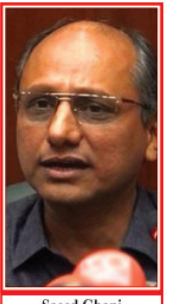
Saeed Ghani Guarantees Timely Disbursal Of Municipal Salaries And Pensions In Sindh Budget