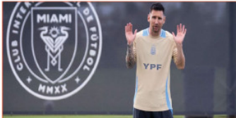
ing to secure another trophy for his country. While revealing the name of the best football team, the eight-time Ballon d'Or winner told Infobase: "The best team is Real Madrid. If you go by results, Real Madrid is the best." He added: "If you go by level of the play, I think Pep Guardiola's Manchester City are the best." Messi played in Barcelona when Pep Guardiola was managing the Spanish football club between 2008 and 2012. Messi praised his former manager when Manchester City won their historic titles of the Champions League and Premier League. Man City won its fourth consecutive Premier League title in May under Guardiola. He told Titan Sports: "[Guardiola's] the best coach in the world although, for me, he didn't have to win this Champions League to prove it, but [it is] an achievement he deserves." Real Madrid last month won their record 15th Champions League title after defeating Borussia Dortmund at Wembley.

Argentine international Lionel Messi revealed the name of the greatest football team and surprisingly it is not David Beckham's Inter Miami, of which the 36-year-old is currently part of. The Inter Miami striker has climbed up the ladder of becoming one of the greatest during his stay at the Major League Soccer (MLS). During his 15 appearances, the Argentine World Cup winner netted 14 times in all competitions. Now, Lionel Messi is gearing up to appear at the Copa America, aim-