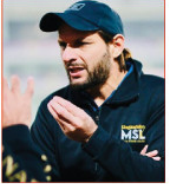
why I think he shouldn't have given away so many runs," the former captain added.

KARACHI: Former cricket captain Shahid Afridi called Pakistan's shocking defeat at the hands of the United States Thursday during their maiden game of the T20 World Cup 2024 a major blunder. The Green Shirts lost during the Super Over by five runs after they were provided a target of 19 runs at the Grand Prairie Stadium, Dallas. While speaking on his YouTube channel Friday, the 47-year-old Afridi said: "They made a huge mistake by opting for Ifthikhar instead of Fakhar to play the first ball of the Super Over. The left-arm fast bowler would have suited Fakhar because of the angle of the bowling."