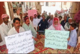
By Qaimuddin Memon