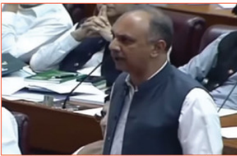
He demanded the House summon the FIA's director general to question his jurisdiction and also about the language which was used in the call-up notice. Ayub said that he and several other PTI leaders were booked in terrorism cases in Sargodha. He alleged that "aliens" were involved in the disappearances of party workers whenever they came out of jail. He slammed that association with the Imran-founded party was seemingly becoming a crime in the country while there was no law in place which could stop such illegal activities. He went on to say that the former prime minister,