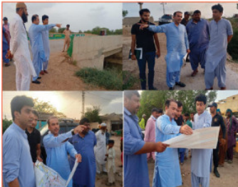
By Qaimuddin Memon

Officials accompanying Rind provided detailed briefings on the progress of the first phase of cleaning, assuring