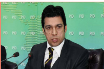
Mustafa Kamal's press conference by 28 news channels. "In Prima facie, broadcasting such press conferences falls under the contempt of court," the order read. The apex court also sought replies from the news channels and asked as to why contempt of court action should not be taken against them. It is pertinent to mention here that the SC rejected the unconditional apology tendered by Syed Mustafa Kamal while Faisal Vawda refused to apologies.

ISLAMABAD: The Supreme Court (SC) of Pakistan summoned Mutahida Qaumi Movement-Pakistan (MQM-P) Deputy Convener Syed Mustafa Kamal and independent Senator Faisal Vawda in contempt of court case, media reported. The SC issued a written order of Thursday's hearing, maintaining that Syed Mustafa Kamal tendered an unconditional apology and left himself at the mercy of the court. The order said that Faisal Vawda's counsel sought time to submit an additional reply while the Pakistan Electronic Media Regulatory Authority (PEMRA) submitted the transcript of the press conferences held by both parliamentarians. The apex court in its order maintained that Faisal Vawda's press conference was broadcast by 34 news channels and while Syed