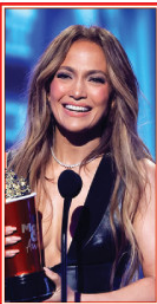
Jennifer Lopez's path to 'rebuild' her brand laid bare