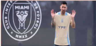
ing to secure another trophy for his country. While revealing the name of the best football team, the eight-time Ballon d'Or winner told Infobase: "The best team is Real Madrid. If you go by results, Real Madrid is the best." He added: "If you go by level of the play, I think Pep Guardiola's Manchester City are the best." Messi played in Barcelona when Pep Guardiola was managing the Spanish football club between 2008 and 2012. Messi praised his former manager when Manchester City won their historic titles of the Champions League and Premier League. Man City won its fourth consecutive Premier League title in May under Guardiola. He told Titan Sports: "[Guardiola's] the best coach in the world although, for me, he didn't have to win this Champions League to prove it, but [it is] an achievement he deserves." Real Madrid last month won their record 15th Champions League title after defeating Borussia Dortmund at Wembley.

Argentine international Lionel Messi revealed the name of the greatest football team and surprisingly it is not David Beckham's Inter Miami, of which the 36-year-old is currently part of. The Inter Miami striker has climbed up the ladder of becoming one of the greatest during his stay at the Major League Soccer (MLS). During his 15 appearances, the Argentine World Cup winner netted 14 times in all competitions. Now, Lionel Messi is gearing up to appear at the Copa America, aim-