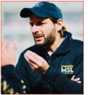
why I think he shouldn't have given away so many runs," the former captain added.

KARACHI: Former cricket captain Shahid Afridi called Pakistan's shocking defeat at the hands of the United States Thursday during their maiden game of the T20 World Cup 2024 a major blunder. The Green Shirts lost during the Super Over by five runs after they were provided a target of 19 runs at the Grand Prairie Stadium, Dallas. While speaking on his YouTube channel Friday, the 47-year-old Afridi said: "They made a huge mistake by opting for Iftikhar instead of Fakhar to play the first ball of the Super Over. The left-arm fast bowler would have suited Fakhar because of the angle of the bowling."