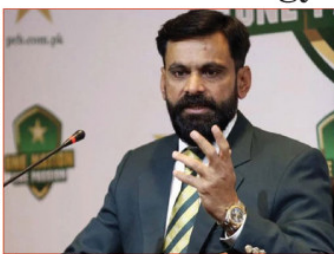
time while this was Amir's first international tournament after returning to cricket. "Who was the best bowler? For me, it would be Naseem Shah and then Shaheen Shah Afridi. Amir was away from Pakistan cricket for four years. Don't try to compare international T20 leagues to international cricket. You didn't trust your main player and trusted someone who is making a comeback after four years," Hafeez said. The former cricketer also slammed the team for not being able to keep their nerves together and lost to a team with not much international experience as Pakistan. "How did Pakistan lose not one, but two matches in a day? First, we lost the 20-over game and then the super over. We understand you were nervous. It was a nervous batting innings, it was nervous bowling and fielding. I understand it in the 20-over game. But you couldn't control your nerves in a Super Over?" he concluded. Pakistan now play arch-rivals India next on June 9 in New York, should they suffer another defeat, their chances of qualifying for the World Cup Super 8 would be little to one. On the other hand, the USA have now two wins in two matches and they are in a strong position to make way to the last eight.

LAHORE: Former Pakistan captain Mohammad Hafeez questioned the Green Shirts' Super Over strategy against the United States (USA) in their first match of the T20 World Cup 2024 which was played at the Grand Prairie Stadium, Dallas, on Thursday. Pakistan's Mohammad Amir took the ball in the Super Over and the USA concluded their innings 18-1 in reply, Pakistan could only score 13-1 and ended up losing the match by five runs. Talking to local media channel after the match, Hafeez expressed unhappiness with Amir bowling the last over, saying it should have been Shaheen Afridi or Naseem Shah as both have been playing cricket for a long