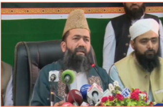
Taxila, Murree, Narowal and Lahore.