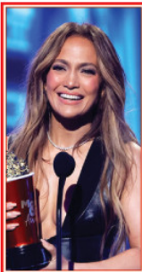
Jennifer Lopez's path to 'rebuild' her brand laid bare