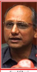
Saeed Ghani Guarantees Timely Disbursal Of Municipal Salaries And Pensions In Sindh Budget