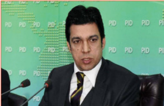
Mustafa Kamal's press conference by 28 news channels. "In Prima facie, broadcasting such press conferences falls under the contempt of court," the order read. The apex court also sought replies from the news channels and asked as to why contempt of court action should not be taken against them. It is pertinent to mention here that the SC rejected the unconditional apology tendered by Syed Mustafa Kamal while Faisal Vawda refused to apologise. The Supreme Court (SC) has issued contempt of court notices to independent Senator Faisal Vawda and MQM-Pakistan MNA Mustafa Kamal over anti-judiciary rhetoric. The apex court sought notice of press conferences held by Senator Faisal Vawda and Kamal wherein they demanded evidence of interference in the judiciary. The top court then issued notices to both leaders and asked them to submit their response before the court.

ISLAMABAD: The Supreme Court (SC) of Pakistan summoned Mutahida Qami Movement-Pakistan (MQM-P) Deputy Convener Syed Mustafa Kamal and independent Senator Faisal Vawda in contempt of court case, media reported. The SC issued a written order of Thursday's hearing, maintaining that Syed Mustafa Kamal and Vawda in contempt of court case, media reported. The order said that Faisal Vawda's counsel sought time to submit an additional reply while the Pakistan Electronic Media Regulatory Authority (PEMRA) submitted the transcript of the press conferences held by both parliamentarians. The apex court in its order maintained that Faisal Vawda's press conference was broadcast by 34 news channels and while Syed