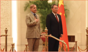
their firm commitment to protect CPEC from its detractors and adversaries and to upgrade CPEC in the form of enhanced cooperation," the statement said. The prime minister also reaffirmed Pakistan's unflinching resolve to ensure the safety and security of Chinese personnel and projects in Pakistan. Chinese investment and financial support since 2013 have been key for the South Asian nation's struggling economy, including the rolling over of loans so that

BEIJING: Pakistan and China have vowed to protect the China-Pakistan Economic Corridor (CPEC) from its detractors and adversaries as Prime Minister Shehbaz Sharif assured Beijing of providing complete security to personnel working on multi-billion projects. PM Shehbaz is visiting China from June 4 to 8 at the invitation of President Xi Jinping, seeking to upgrade cooperation under the multi-billion dollar China-Pakistan Economic Corridor (CPEC), a key part of Beijing's Belt and Road Initiative. In a statement, the PM's Office said during the meeting, the two sides discussed the significance of Gwadar as an important pillar of CPEC and agreed to expedite the timely completion of all related infrastructure projects to transform Gwadar into a regional economic hub. "They also expressed