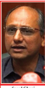
Saeed Ghani Guarantees Timely Disbursal Of Municipal Salaries And Pensions In Sindh Budget