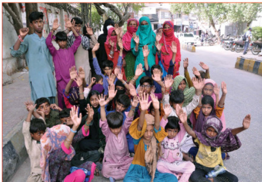
HYDERABAD: Residents of Jamshoro are holding a protest demonstration at the Hyderabad Press Club against their area's police officials.