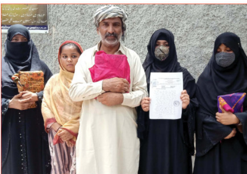
HYDERABAD: Residents of Kotri are holding a protest demonstration at the Hyderabad Press Club against the highhandedness of their area's influential persons.