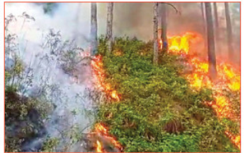
The fire broke out in hilly terrain of Karak that could destroy trees, precious shrubs and wildlife in woods.

It is to be mentioned here that in Lower Dir district of Khyber Pakhtunkhwa a forest fire could not be extinguished even after five days.