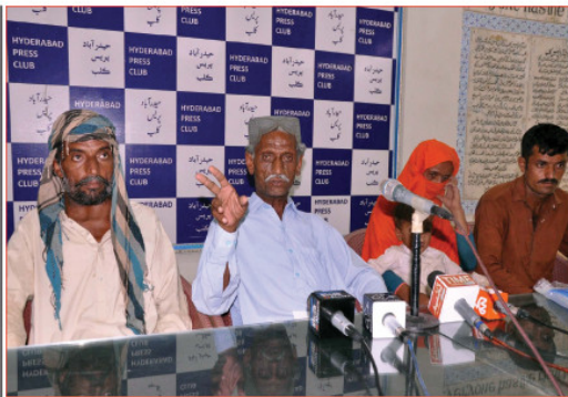
HYDERABAD: Residents of Jamshoro are holding a press conference for the acceptance of their demands, at the Hyderabad press club.