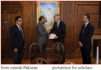
from outside Pakistan.

Since its establishment three years ago, it has become the single largest Pakistan-focused academic platform outside Pakistan.