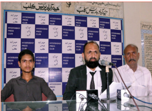
HYDERABAD: Residents of Latifabad are holding a press conference for the acceptance of their demands, at the Hyderabad press club.