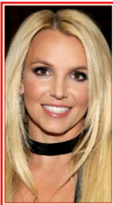
Jessica Biel, Justin Timberlake's marriage takes a hit after Britney Spears memoir