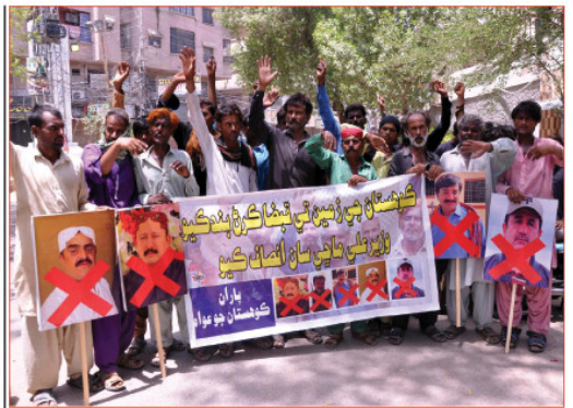
HYDERABAD: Residents of Kohistan are holding a protest demonstration at the Hyderabad press club against their area's land grabbers.