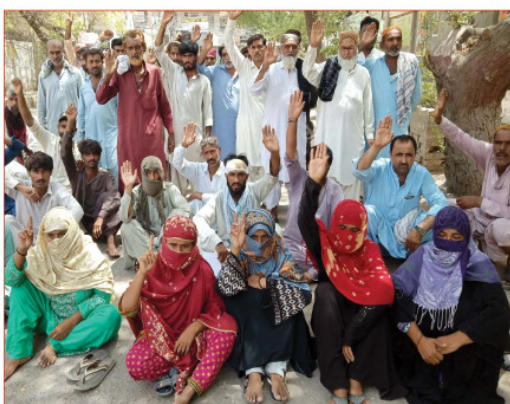
HYDERABAD: Residents of Channel Mori are holding a protest demonstration at the Hyderabad Press Club against the influential people of their area.-RT