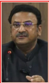
Sindh Home Minister Announces Rs 1 Billion For Karachi Safe City Project