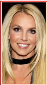
Jessica Biel, Justin Timberlake's marriage takes a hit after Britney Spears memoir