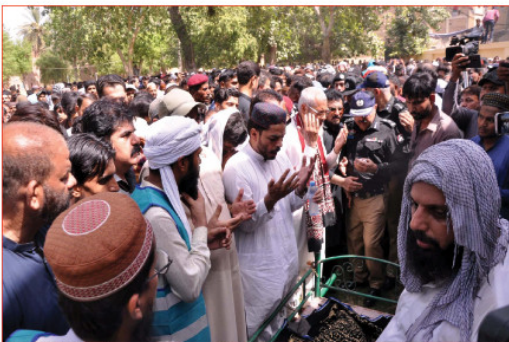
HYDERABAD: Funeral prayers of the victims of a big gas explosion were offered at the Paretabad Eidgah in Hyderabad. An explosion in a gas cylinder shop in Hyderabad's Paretabad area claimed the lives of seven people and left at least 52 others injured, six of whom are in critical condition.