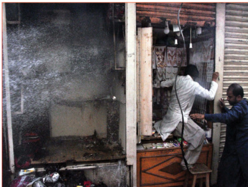
HYDERABAD: A fire broke out due to an electric short circuit at a cloth shop in the Resham Bazaar area of the city.-RT