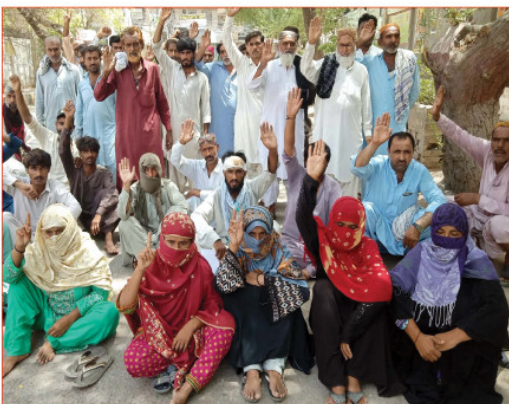
HYDERABAD: Residents of Channel Mori are holding a protest demonstration at the Hyderabad Press Club against the influential people of their area.