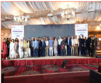
By Asif Qureshi

KARACHI: The National Institute of Cardiovascular Diseases (NICVD) commemorated International Nurses Day 2024 with fervor, embracing the theme "Our Nurses, Our Future: The Economic Power of Care." Held at a local hotel on Friday, May 31, 2024, the event celebrated the indispensable role of nurses in healthcare.