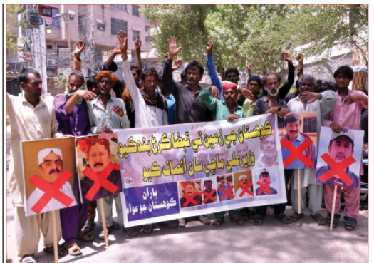
HYDERABAD: Residents of Kohistan are holding a protest demonstration at the Hyderabad press club against their area's land grabbers.