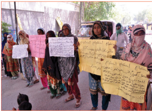
HYDERABAD: Residents of Tando Hyder are holding protest demonstration against high handedness of land grabbers, at Hyderabad press club.