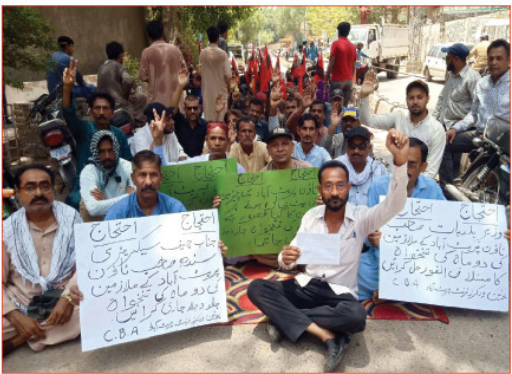
HYDERABAD: Employees of Paretabad Town Committee are holding a protest demonstration against the non-payment of their salaries, at the Hyderabad press club.