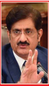
Sindh Cabinet Approves Major Initiatives Including Inclusive City And E-Vehicle Incentives

KARACHI Edition Vol. XV No 163 Regd. No. 114 visit us at www.regionaltimes.com