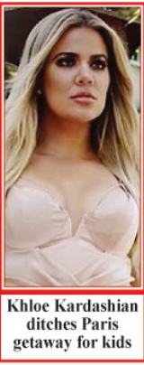
Khloe Kardashian ditches Paris getaway for kids