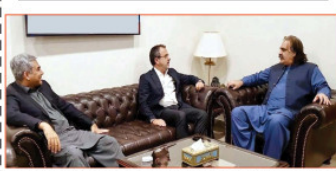
ISLAMABAD: Federal Minister for Interior, Mohsin Naqvi and Sardar Awais Ahmed Khan Laghari, Federal Minister for Energy are exchanging views with Ali Amin Gandapur, Chief Minister of Khyber Pakhtunkhwa during their meeting.