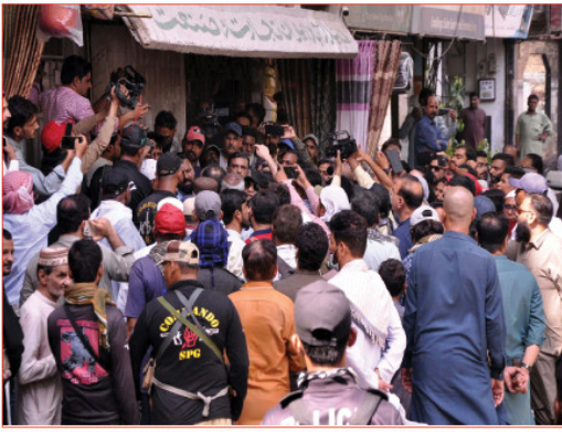
HYDERABAD: View of a clash between two groups of the Hyderabad Chamber of Commerce and Industry (HCCI), outside the HCCI Office.