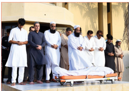
KARACHI: People are attending the funeral prayers of veteran actor Talat Hussain, at Masjid-e-Aysha in DHA, Karachi.—RT

lift was completed for 30 schools, with remaining projects in progress, it added. According to the Education Ministry, acrylic boards and corridor upgrades were also completed in 40 institutes, with remaining projects in progress. However, 100 wash stations were provided in 50 institutes, the ministry stated. It was noted that 21 primary schools and IT parks, with remaining projects in progress. The security wall renovation was ongoing for 80 schools and entrance up- Sharing the details of the new construction stage, the ministry said that as many as 120 rooms in 23 schools are at plinth level or above, targeting completion by the end of June. 65 rooms in 16 schools are at the roof level, with finishing works expected to be completed by the end of June, the ministry stated. It was noted that 21 primary schools and IT parks, with remaining projects in progress. The security wall renovation was ongoing for 80 schools and entrance up- 40 schools expected to be added.—RT/Agency