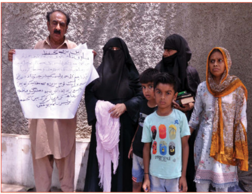
HYDERABAD: Residents of GOR Colony are holding a protest demonstration for the acceptance of their demands, at the Hyderabad press club.-RT