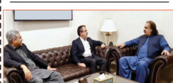
ISLAMABAD: Federal Minister for Interior, Mohsin Naqvi and Sardar Awais Ahmed Khan Laghari, Federal Minister for Energy are exchanging views with Ali Amin Gandapur, Chief Minister of Khyber Pakhtunkhwa during their meeting.—RT