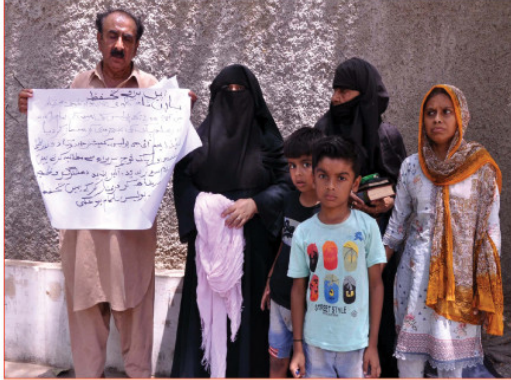
HYDERABAD: Residents of GOR Colony are holding a protest demonstration for the acceptance of their demands, at the Hyderabad press club.