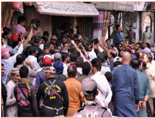
HYDERABAD: View of a clash between two groups of the Hyderabad Chamber of Commerce and Industry (HCCI), outside the HCCI Office.